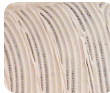
ABOVE: Troweling Arjay Core Bonding Compound on hull sides prior to joining with liner LEFT: Compound trowels easy and "stays put" at any application angle

For More Applications, See www.arjaytech.com